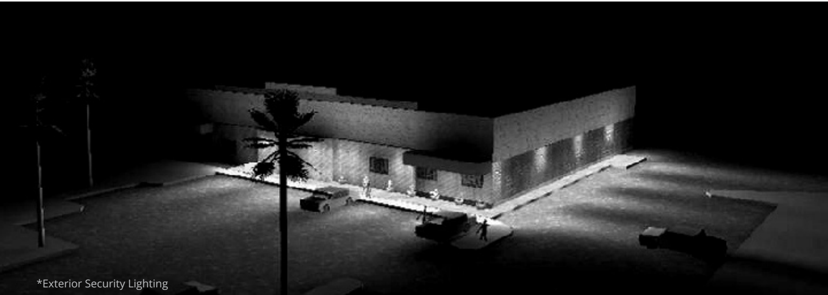
*Exterior Security Lighting